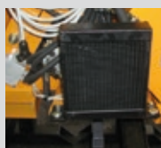
Oil cooler with thermostat (option only for TA32 and TAR32)