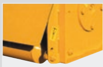
Adjustable rear roller