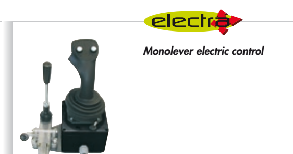
Monolever electric control