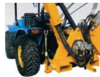
TAR32 version for reversible drive