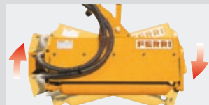
Floating head system