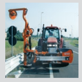
Patented hydraulic device permitting the outer arm to be litted in order to overcome possible posts, trees, obstacles.