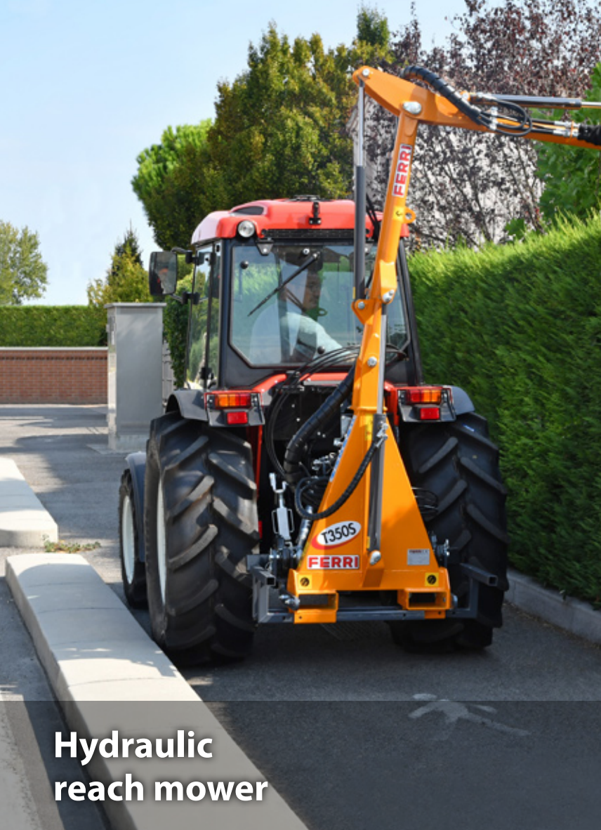
Hydraulic reach mower